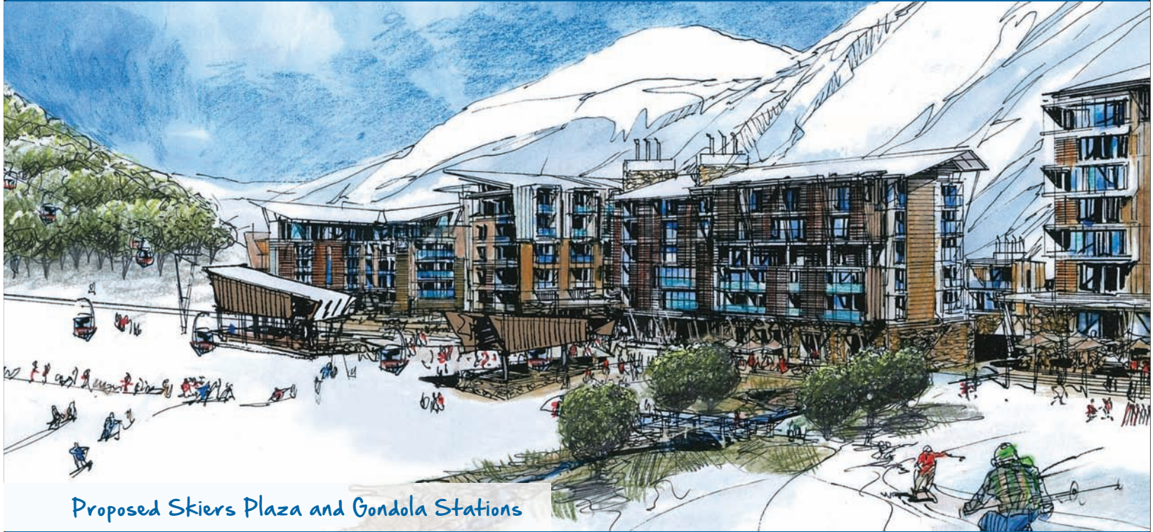
Proposed Skiers Plaza and Gondola Stations